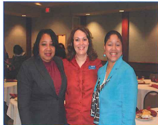
Coalition partners from the 4th JDC District Attorney's Office and ULM work with the MacArthur Models for Change: Systems Reform in Juvenile Justice efforts