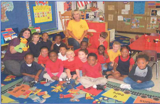
A Pre-K 4 Classroom at Sallie Humble is one of the 66 classes implementing AI's Pals within Ouachita Parish and Monroe City Schools